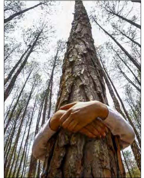
A Nepalese man hugs a tree while celebrating World Environment Day at the forest of Gokarna, on the outskirts of Kathmandu, in 2014.

11. What was the attitude of Jesus toward creation (96-100)?